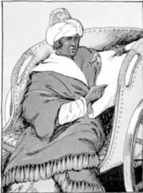
The Ethiopian Eunuch, Acts 8